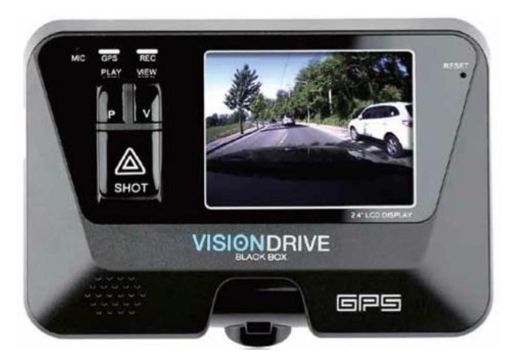
Figure 1: A sample VMD unit

The data is recorded onto SD cards, and can be transferred to computer for analysis or hard-drive for storage. There is accompanying software to analyse the various performance parameters.